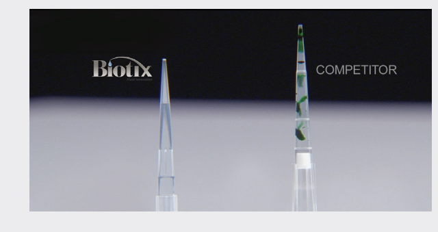
FIGURE 1: BIOTIX LOW RETENTION PIPETTE TIP COMPARED TO NON-LOW RETENTION TIP, DEMONSTRATED WITH GREEN DYE

To further examine the effects of pipette tips on sample retention, a comprehensive study (validated by an independent third party research institute) was conducted to measure sample loss after dispensing fluorescently labeled protein in three tip brands: Biotix; Competitor tip A (low-retention tips); Competitor tip B (regular tips).